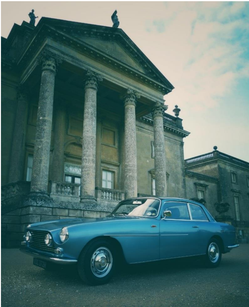
Johnnie Gallop collection

Page 369: Papa’s Bristol car, somewhere in the west of England while we were on holiday.